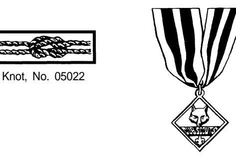
Cubmaster Award, No. 00949